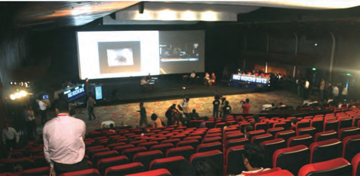
NIC 2012; Le Meridien, Kochi