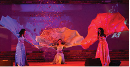
Pepper Awards 2012; Le Meridien, Kochi