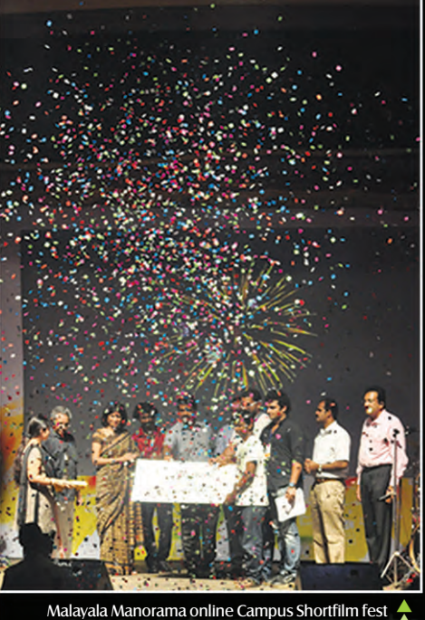
Malayala Manorama online Campus Shortfilm fest Grand finale; Regional Theatre, Thrissur